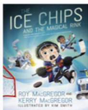
The Ice Chips and the Magical Rink by Roy MacGregor