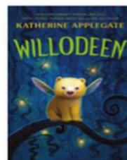
Willodeen by Katherine Applegate

We currently have FIVE copies of each book at the Promontory Library. Additional copies are also available from the FVRL Chwk and Sardis Branches. The Chilliwack Library has acquired 10 additional copies of each of this year's RLC titles! These copies are not catalogued like the rest of the collection, but instead live at the Information Desk at the Chilliwack Library (the downtown branch). Students can get a copy by going down to the library and talking to one of the friendly staff members.