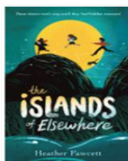
The Islands of Elsewhere by Heather Fawcett